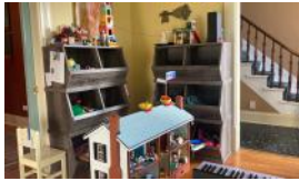
ETH DOLLHOUSE AT BINGO