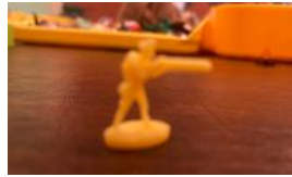
YELLOW TROOP NEAR FORTRESS MOONBEAM