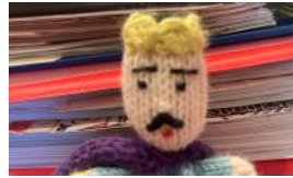
KING ELECTED VICE EMPEROR OF ETHANLAND