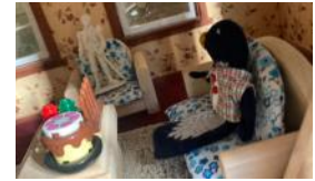
EMPEROR BLUE EYES IN LIVING ROOM OF DOLLHOUSE